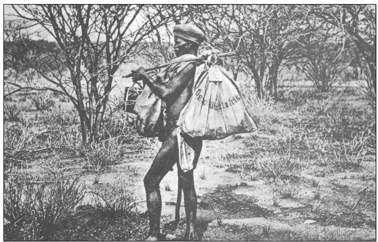
Postal runner on the route Tsumeb – Ondangwa with post bag and pouch of provisions.

the postal runner's mortal remains nor the mail was found. People were also a threat. During the armed conflict between Nama and Herero sealed documents were viewed with suspicion by both warring parties, even though the missionaries did their best to remain neutral and mediate between the two.