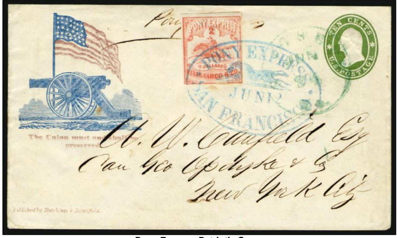
Pony Express Patriotic Cover.

The Smithsonian National Postal Museum celebrated its 25th Anniversary back in July, but we are celebrating all-year-round our silver anniversary! With more than 6 million objects in our collection, the Museum is able to tell unique stories from America's history. We asked members of our community, including staff, visitors, council members, volunteers and donors, to share what their favorite object from our collection and their responses varied from as small as a postage stamp to as large as a bus! Each person chose an object that captures America's compelling stories and collectively reflect the diversity of the Museum's collection. Did your favorite make the list?