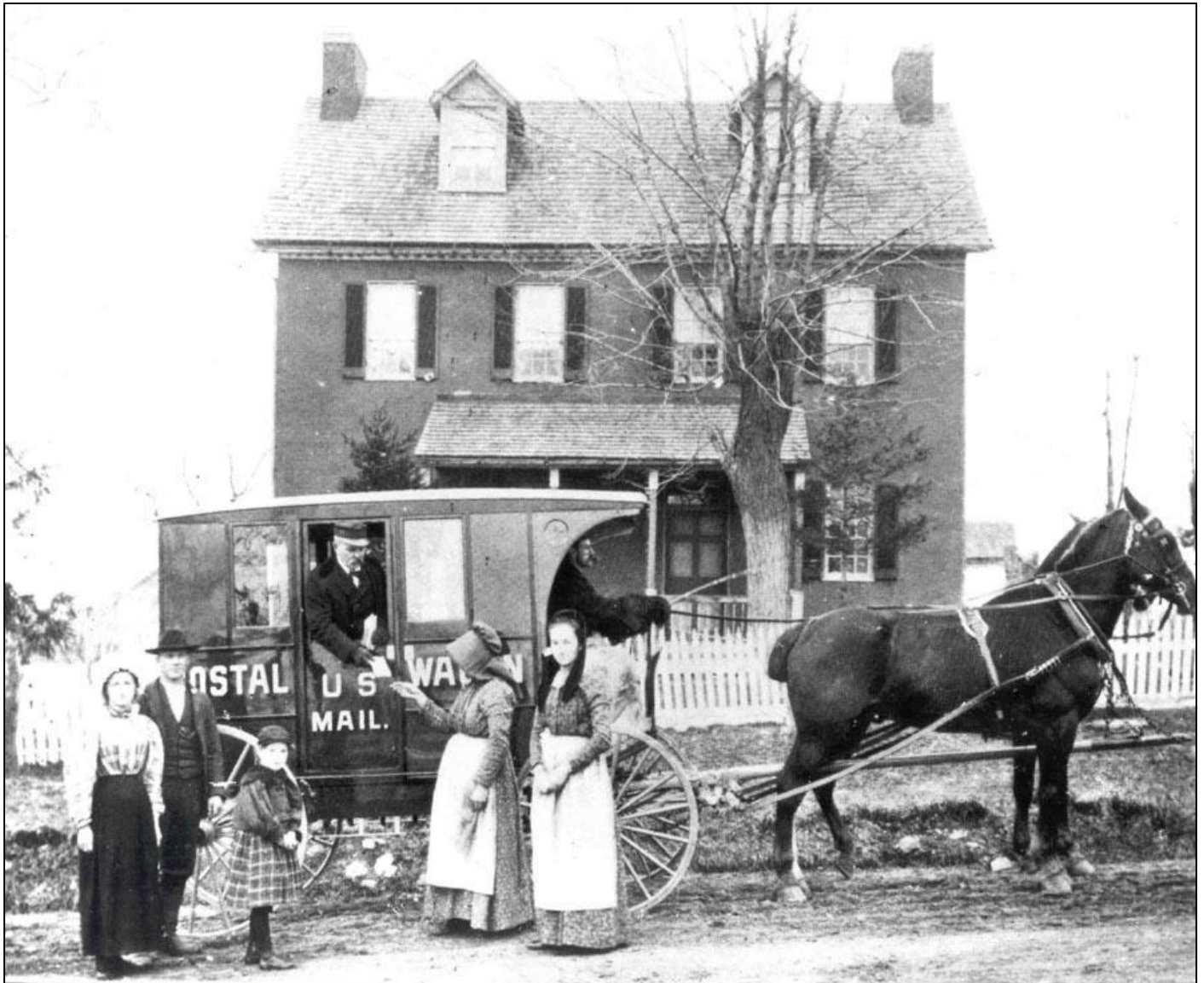
Photograph of a family in Westminster, Maryland, receiving mail on the first day of Rural Free Delivery service in Carroll county.

When agents had made their determinations, they would send their notes and route maps back to Department headquarters in Washington, DC, where the final decision was made on granting the route. Getting a route started did not end an inspector's duties. They inspected the routes twice a year to make sure that everything (carriers, mailboxes, and roads) met the Department's specifications. As Postal Laws and Regulations Applicable to the Rural Mail Service noted in 1915, "Postmasters, clerks, employees, contractors, and others associated with the postal service are subordinate to post-office inspectors."