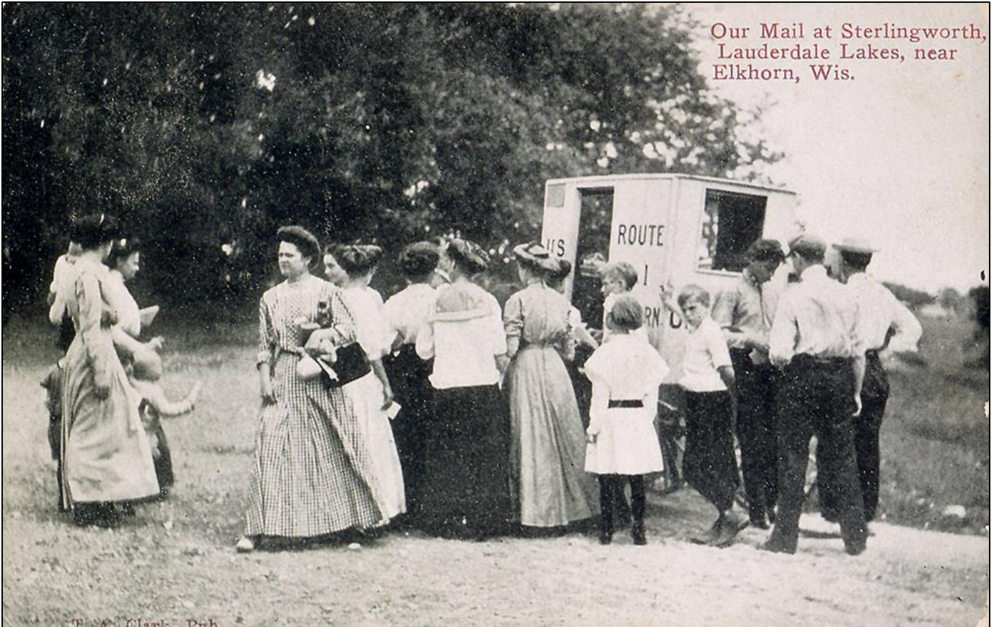
Postcard captioned, "Our Mail at Sterlingworth, Lauderdale Lakes, near Elkhorn, Wis." The image shows rural patrons crowding a Rural Free Delivery wagon, hoping for mail.