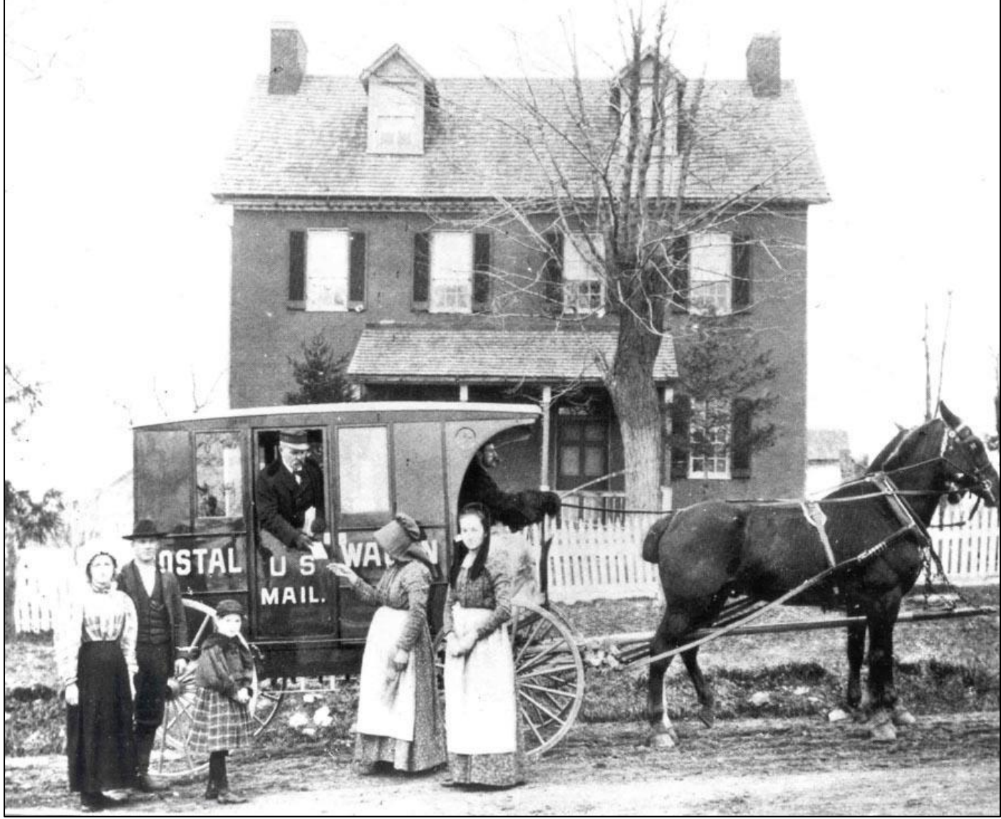
Photograph of a family in Westminster, Maryland, receiving mail on the first day of Rural Free Delivery service in Carroll county.

When agents had made their determinations, they would send their notes and route maps back to Department headquarters in Washington, DC, where the final decision was made on granting the route. Getting a route started did not end an inspector's duties. They inspected the routes twice a year to make sure that everything (carriers, mailboxes, and roads) met the Department's specifications. As Postal Laws and Regulations Applicable to the Rural Mail Service noted in 1915, "Postmasters, clerks, employees, contractors, and others associated with the postal service are subordinate to post-office inspectors."