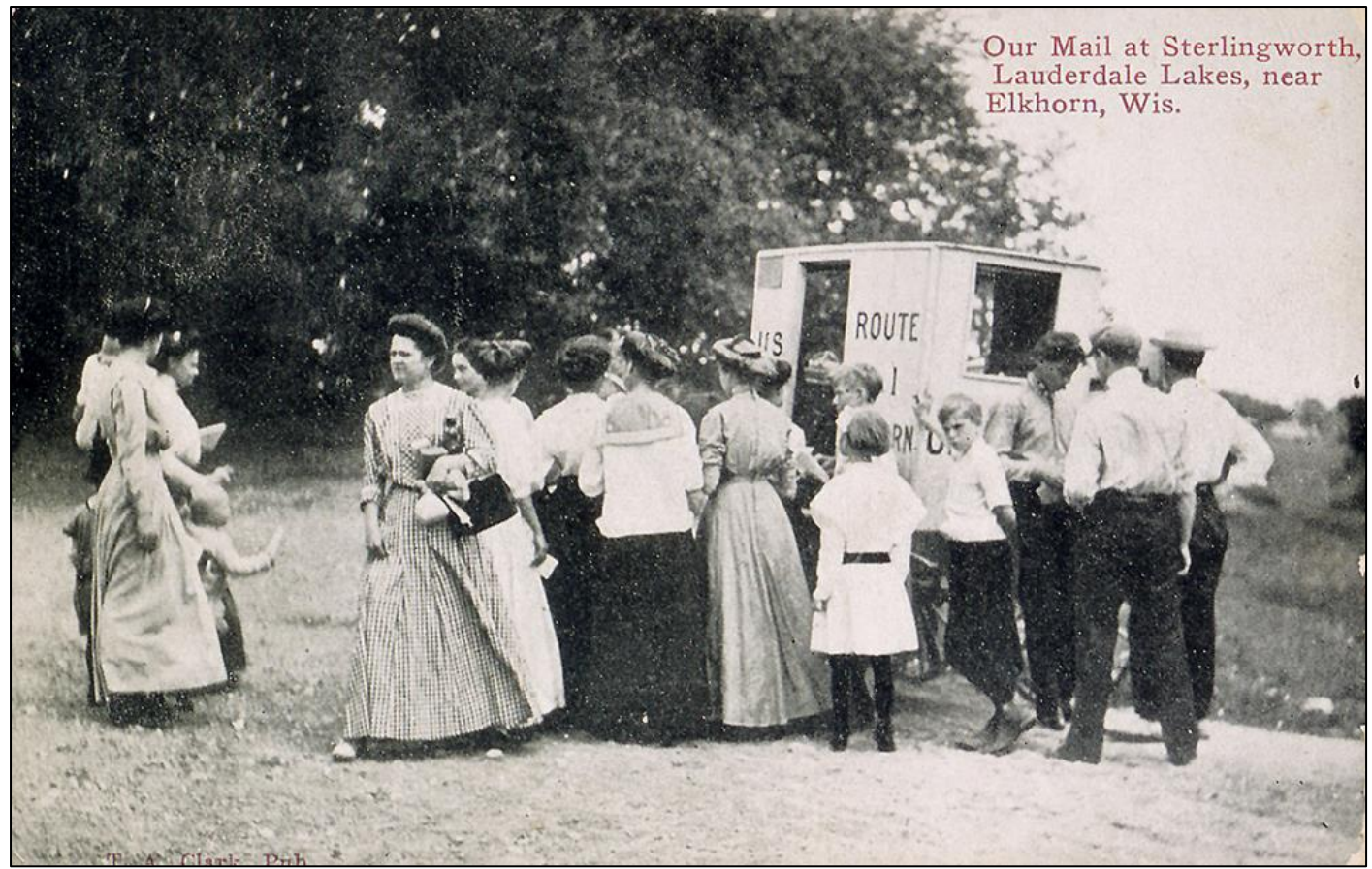
Postcard captioned, "Our Mail at Sterlingworth, Lauderdale Lakes, near Elhorn, Wis." The image shows rural patrons crowding a Rural Free Delivery wagon, hoping for mail.